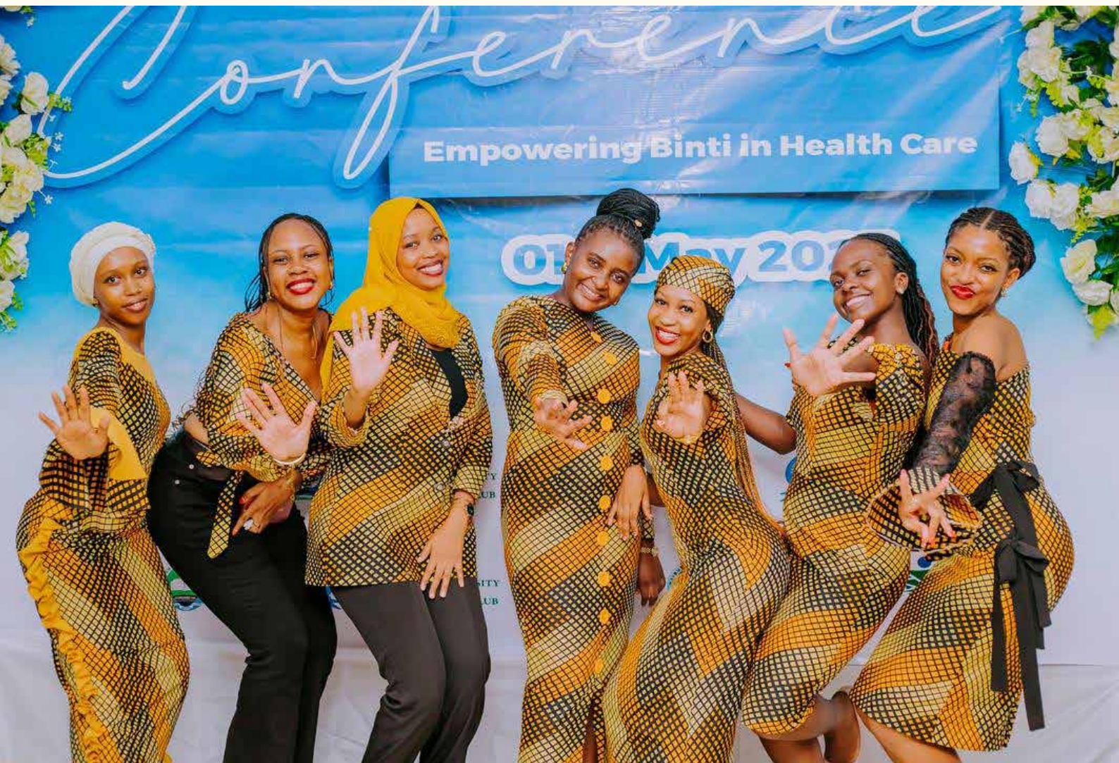
Highlights from the Binti Kairuki event, showcasing different moments captured during the event.