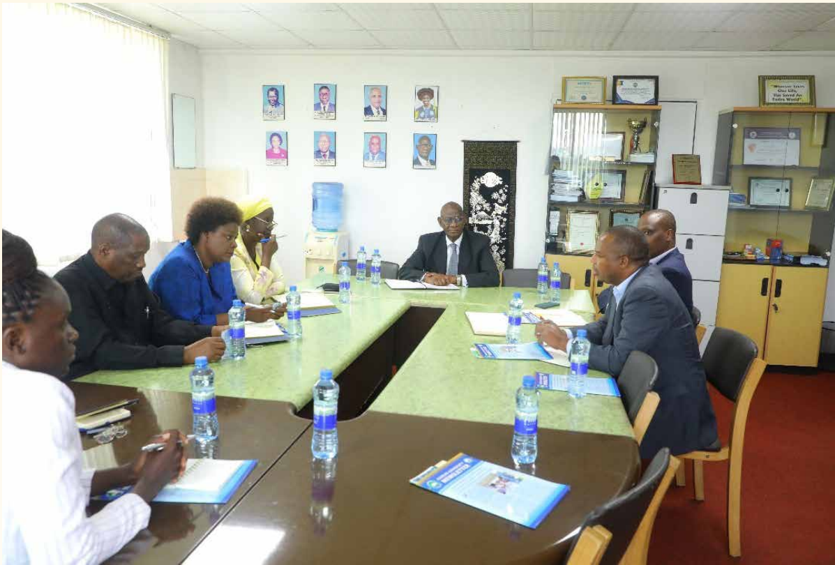
Photo: Discussion between delegates from University of Rwanda (right), the KPIL Plant Manager (1 st on left) and KU management.