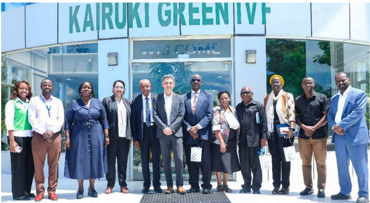
A group photo of delegates from Kairuki University, Kairuki Hospital, Kairuki Hospital Green IVF and Cooper Surgical USA who attended the meeting

For Kairuki University, this collaboration opens exciting new doors hands-on training for OBGY faculty and MMed students, joint academic programmes and workshops in reproductive health and access to global best practices