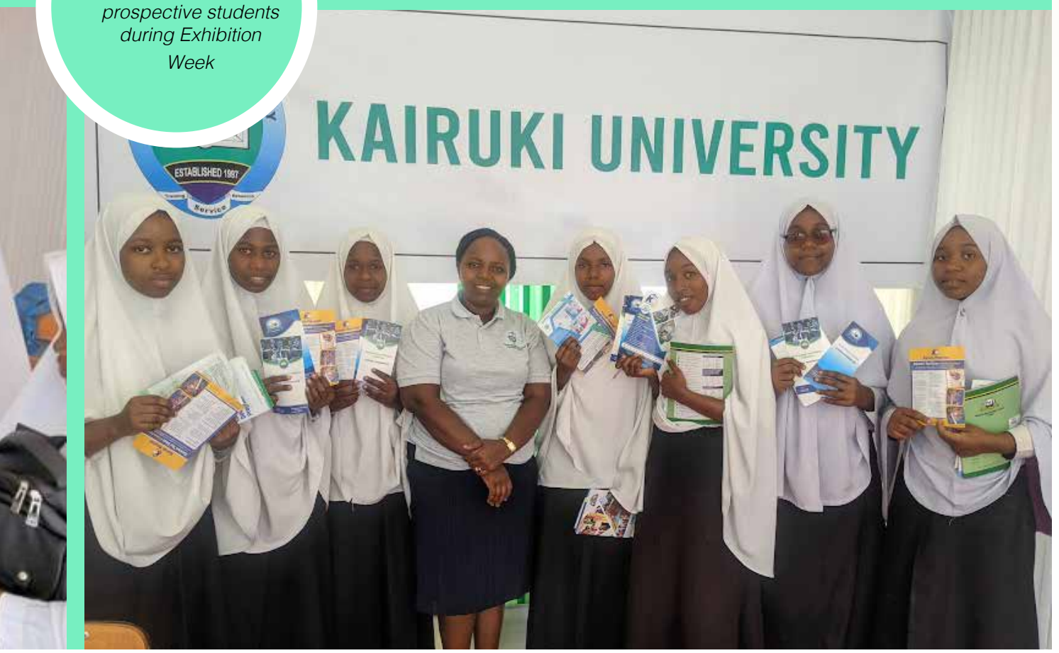
Photo: KU representatives engaging with prospective students during Exhibition Week